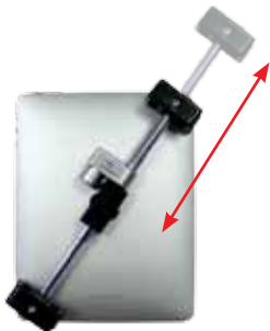
Expands to accommodate various tablet sizes