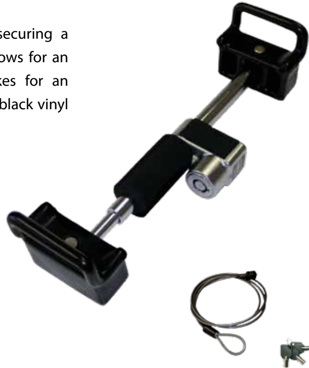
Both the Core 1 and Core 2 include locking keys and a cable